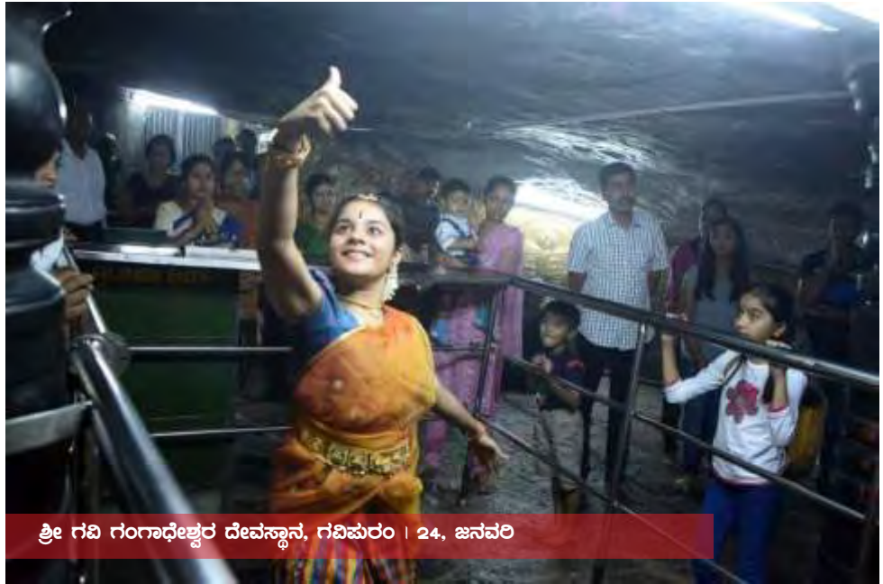
ಶ್ರೀ ಗವಿ ಗಂಗಾಧೇಶ್ವರ ದೇವಸ್ಥಾನ, ಗವಿಪುರಂ | 24, ಜನವರಿ