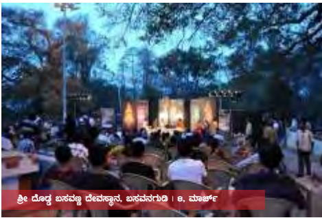
ಶ್ರೀ ದೊಡ್ಡ ಬಸವಣ್ಣ ದೇವಸ್ಥಾನ, ಬಸವನಗುಡಿ | ಎ. ಮಾರ್ಚ್