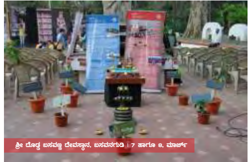
ಶ್ರೀ ದೊಡ್ಡ ಬಸವಣ್ಣ ದೇವಸ್ಥಾನ, ಬಸವನಗುಡಿ | 7 ಜಾಗೂ ೮, ಮಾರ್ಚ್