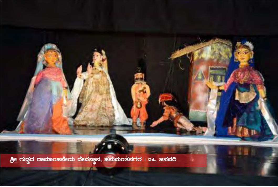
ಶ್ರೀ ಗುಡ್ಡದ ರಾಮಾಂಜನೇಯ ದೇವಸ್ಥಾನ, ಹನುಮಂತನಗರ | 24, ಜನವರಿ