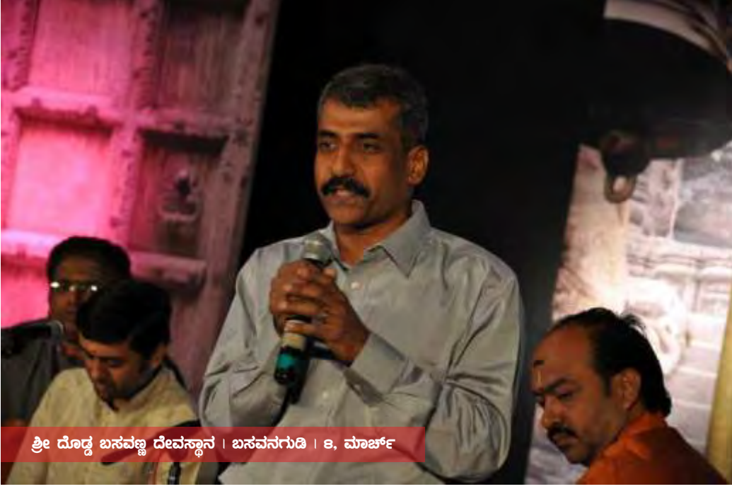
ಶ್ರೀ ದೊಡ್ಡ ಬಸವಣ್ಣ ದೇವಸ್ಥಾನ | ಬಸವನಗುಡಿ | ೮, ಮಾರ್ಚ್