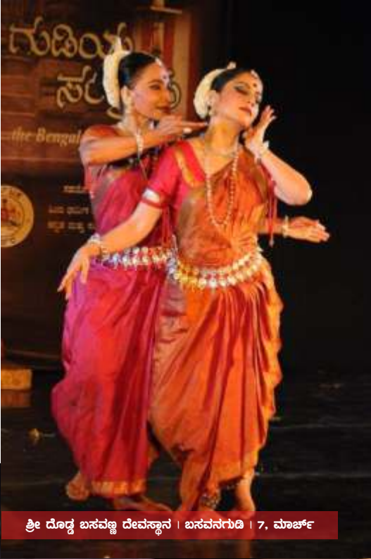
ಶ್ರೀ ದೊಡ್ಡ ಬಸವಣ್ಣ ದೇವಸ್ಥಾನ | ಬಸವನಗುಡಿ | 7, ಮಾರ್ಚ್