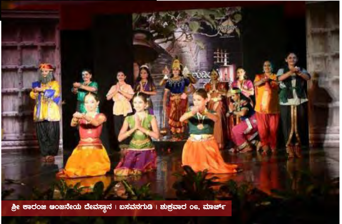
ಶ್ರೀ ಕಾರಂಜಿ ಅಂಜನೇಯ ದೇವಸ್ಥಾನ | ಬಸವನಗುಡಿ | ಶುಕ್ರವಾರ ೦೬, ಮಾರ್ಚ್