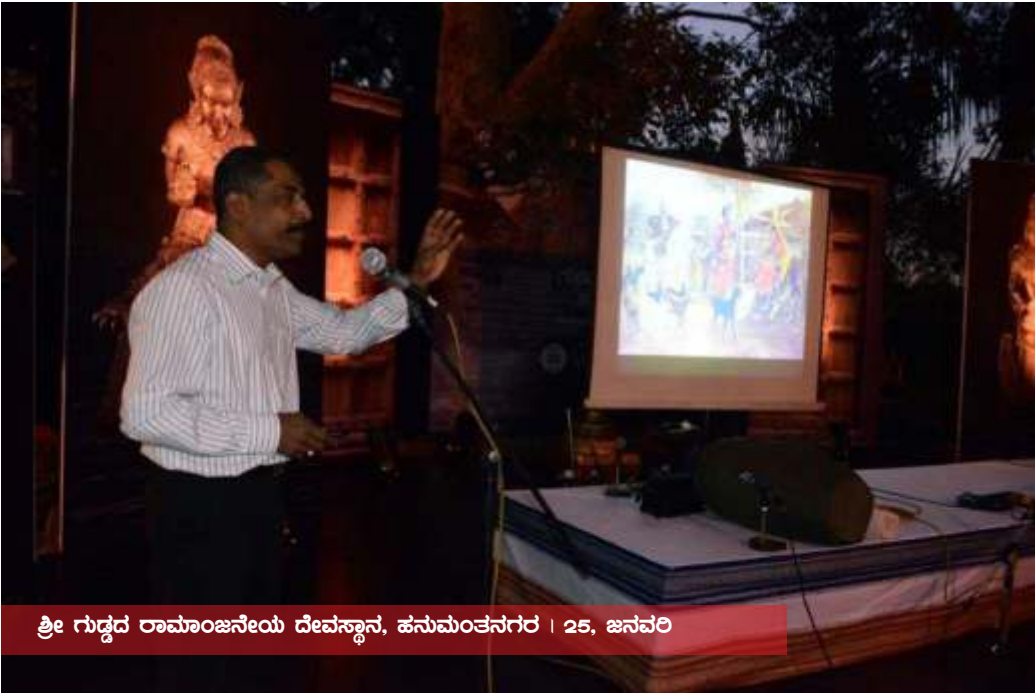
ಶ್ರೀ ಗುಡ್ಡದ ರಾಮಾಂಜನೇಯ ದೇವಸ್ಥಾನ, ಹನುಮಂತನಗರ | 25, ಜನವರಿ